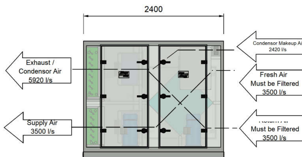
ELEVATION VIEW - COMPRESSOR ACCESS PANEL SIDE