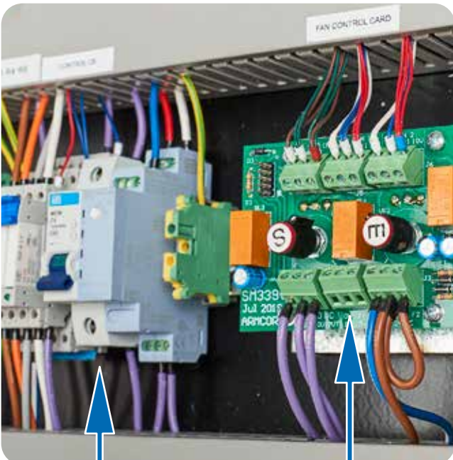
Phase Failure Relay

Tighten all electrical connections before starting and commissioning unit.